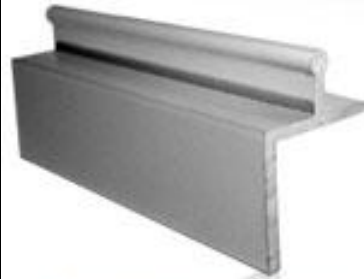
Aluminum Base Channel (3/4" x 3/4")